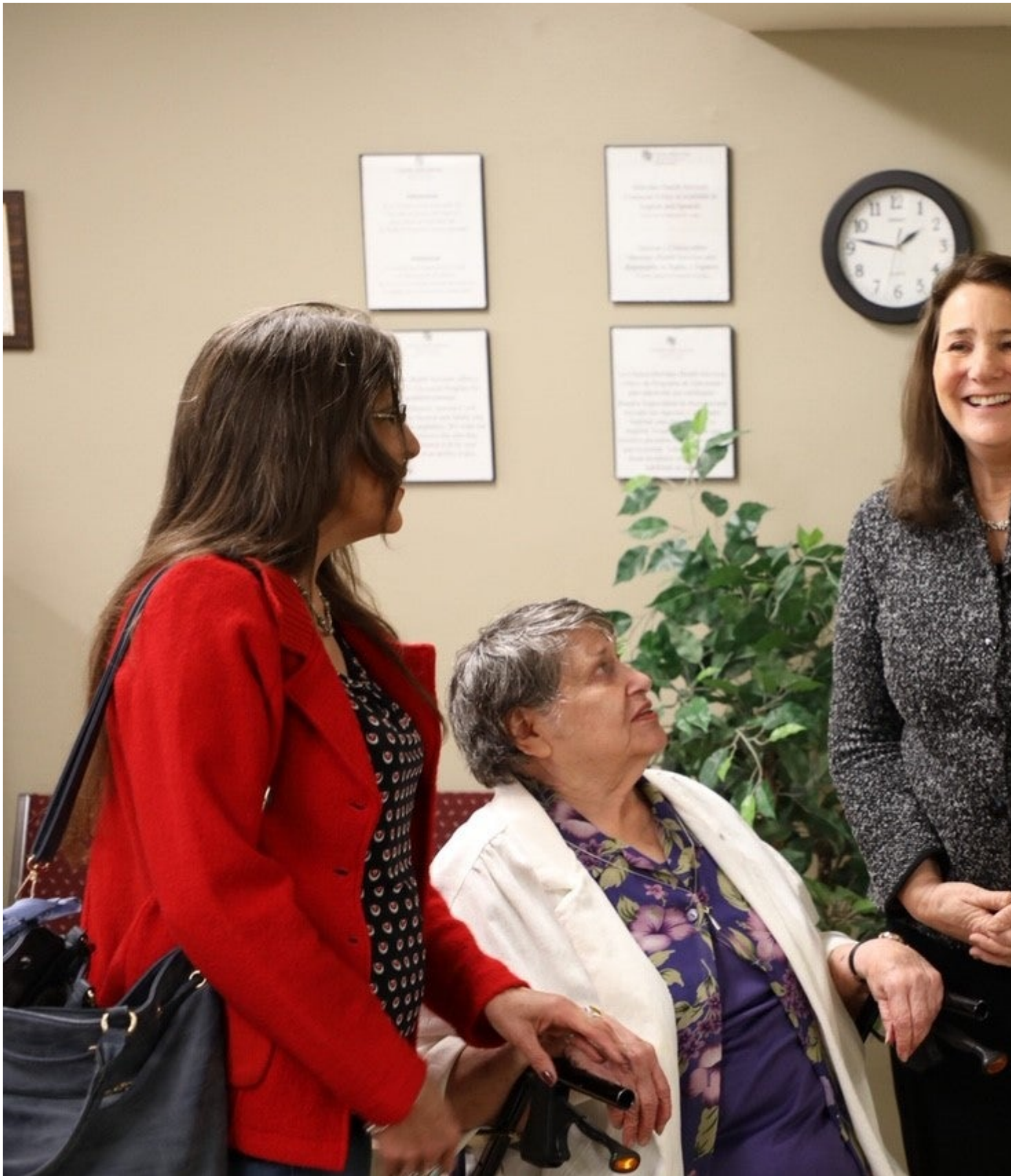
Congresswoman Diana DeGette speaks with patients at Sheridan Health Services